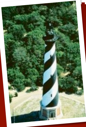
Cape Hatteras Lighthouse

Memorial and climb "Big Kill Devil Hill". We will explore Jockey's Ridge State Park with the largest living natural sand dune on the East Coast. We will climb lighthouses and take ferry rides on the ocean. We will participate in the Crystal Coast Lady Ocean Studies Program for some hands on ocean science. We will learn while having lots of FUN!