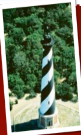
Cape Hatteras Lighthouse The Cape Hatteras Lighthouse, also known as America's Lighthouse, is the tallest brick beacon in the country standing 208 feet. Climb to the top and look out to the Atlantic Ocean!

Memorial and climb "Big Kill Devil Hill". We will explore Jockey's Ridge State Park with the largest living natural sand dune on the East Coast. We will climb lighthouses and take ferry rides on the ocean. We will participate in the Crystal Coast Lady Ocean Studies Program for some hands on ocean science. We will learn while having lots of FUN!